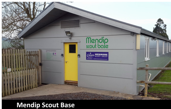
Mendip Scout Base

Wedmore has many fine old buildings, including a 12th-century church; as well as a 'Village Store' that sells a wide range of products, produce and 'goodies'. It is where King Alfred signed a peace treaty with the Danes in AD 878, following their defeat at the Battle of Ethendune.